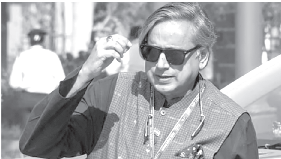
Congress MP Shashi Tharoor

While emphasizing adherence to the rule of law, Tharoor also reiterated the