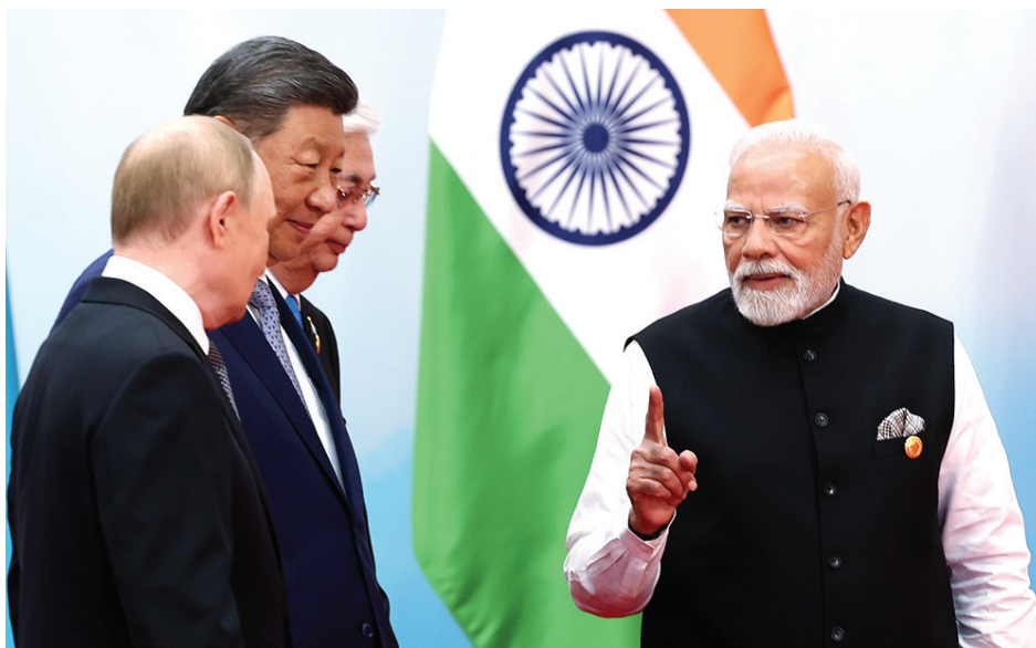
(An exclusive picture from the Yarendor 2025) Prime Minister Narendra Modi, Chinese President Xi Jinping, and Russian President Vladimir Putin in conversation at the venue of the Shanghai Cooperation Council (SCO) Summit, in Tianjin.

This is an opportune moment for investors, innovators and institutions to partner with India, to invest, innovate and build a clean, resilient and future-ready energy ecosystem, he said.