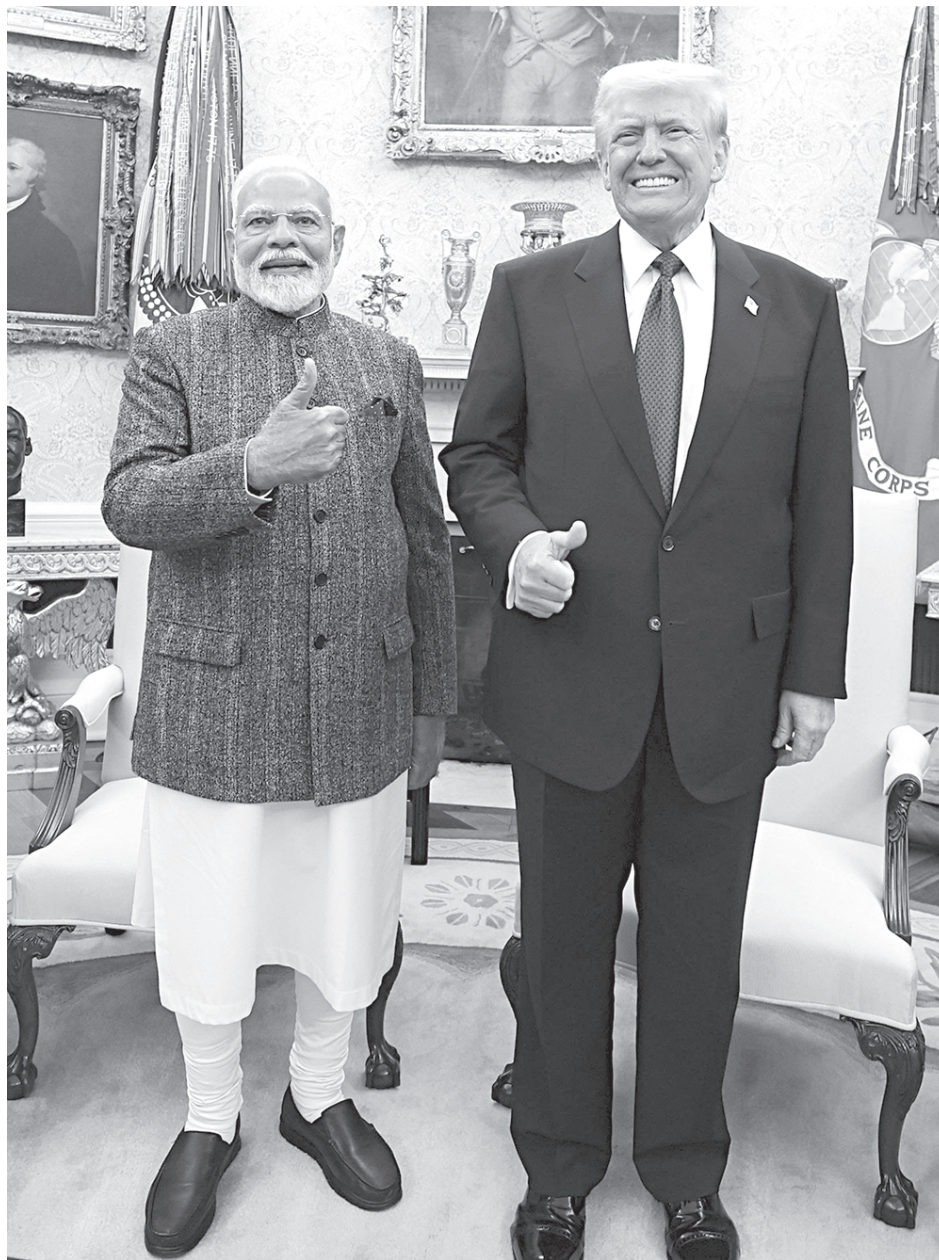
File photo of Prime Minister Narendra Modi with U.S. President Donald Trump, at The White House in Washington, DC

For the first time in many years, senior US officials spoke openly against India. The tone was blunt. The restraint seen in