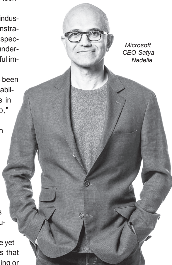
Microsoft CEO Satya Nadella

While AI is advancing rapidly, he admitted that current systems still have rough edges and limitations that need careful management.