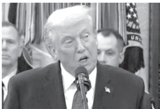
President Donald Trump

"If the United States is confident that they can be successfully removed to another country where they will not be threat-