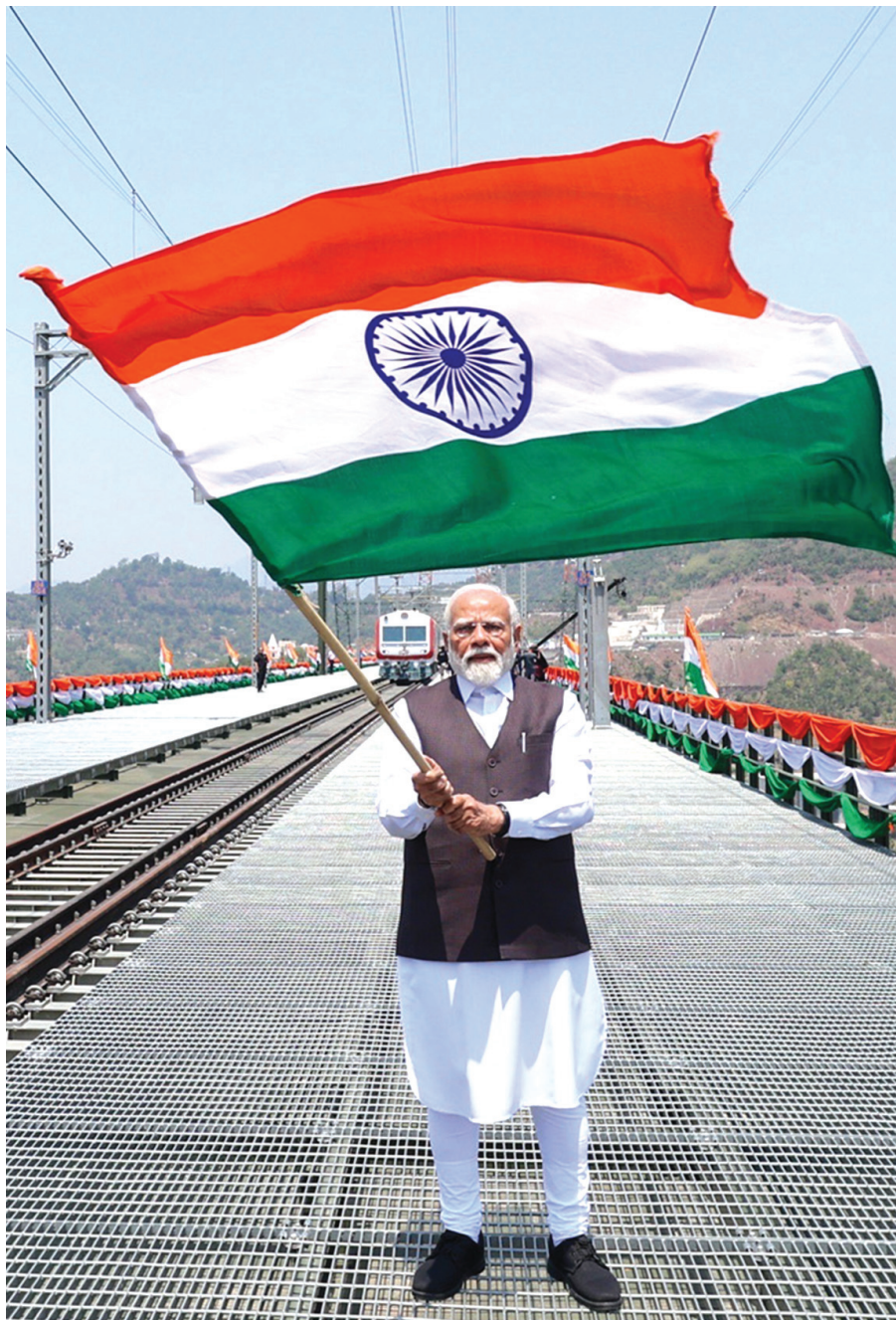
File Photo: PM Modi waves the national flag as he visits the Chenab bridge, in Jammu and Kashmir

INDIA POST WISHES ITS READERS A VERY HAPPY AND PROSPEROUS NEW YEAR