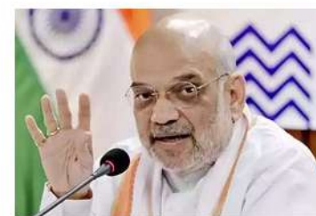
Union Home Minister Amit Shah

meeting was to restore normalcy and peace in Manipur, which has been grappling with ethnic violence between the two groups -- Kuki and Meitei -- since May