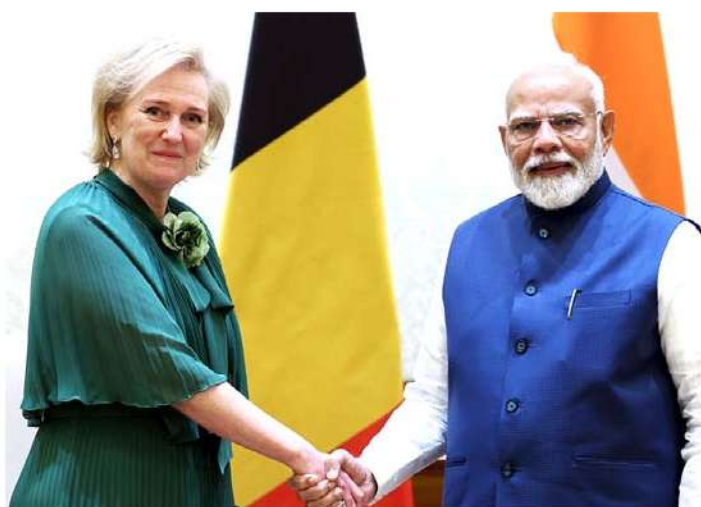
Prime Minister Narendra Modi meets Princess Astrid of Belgium, in New Delhi. (ANI Photo)

Her day ended after a reception including over 800 guests. ANI