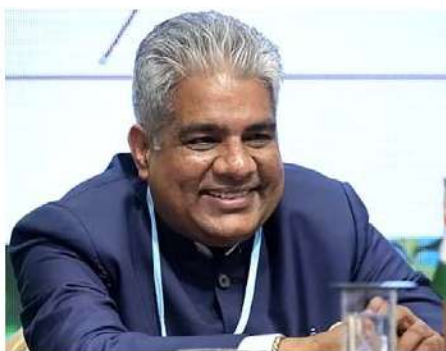
Minister for Environment, Forest & Climate Change Bhupender Yadav

The Minister further said that Circular Economy Action Plans for 10 waste categories have been finalized, for which regulatory and implementation framework is under progress. India has already notified various waste management and extended producer responsibility rules in certain sectors, such as the Plastic Waste Management Rules, e-Waste Management Rules, Construction and Demolition Waste Management Rules, and Metals Recycling Policy, among others.