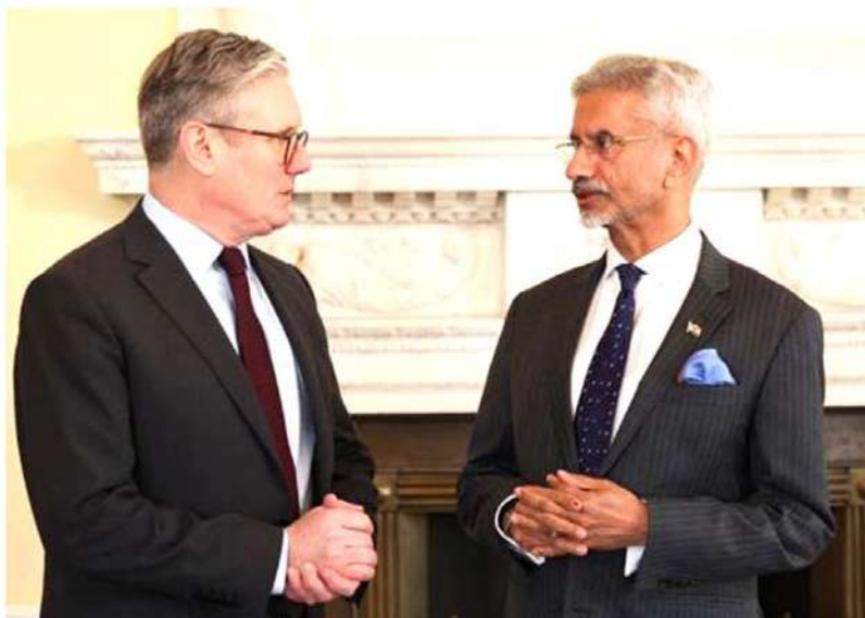
External Affairs Minister S. Jaishankar with UK Prime Minister Keir Starmer

LONDON: External Affairs Minister (EAM) S. Jaishankar met the UK Prime Minister Keir Starmer during his official visit at 10 Downing Street in London to convey warm greetings from Prime Minister Narendra Modi as well as discussed advancing bilateral economic cooperation and enhancing people-to-people exchanges between the two countries.