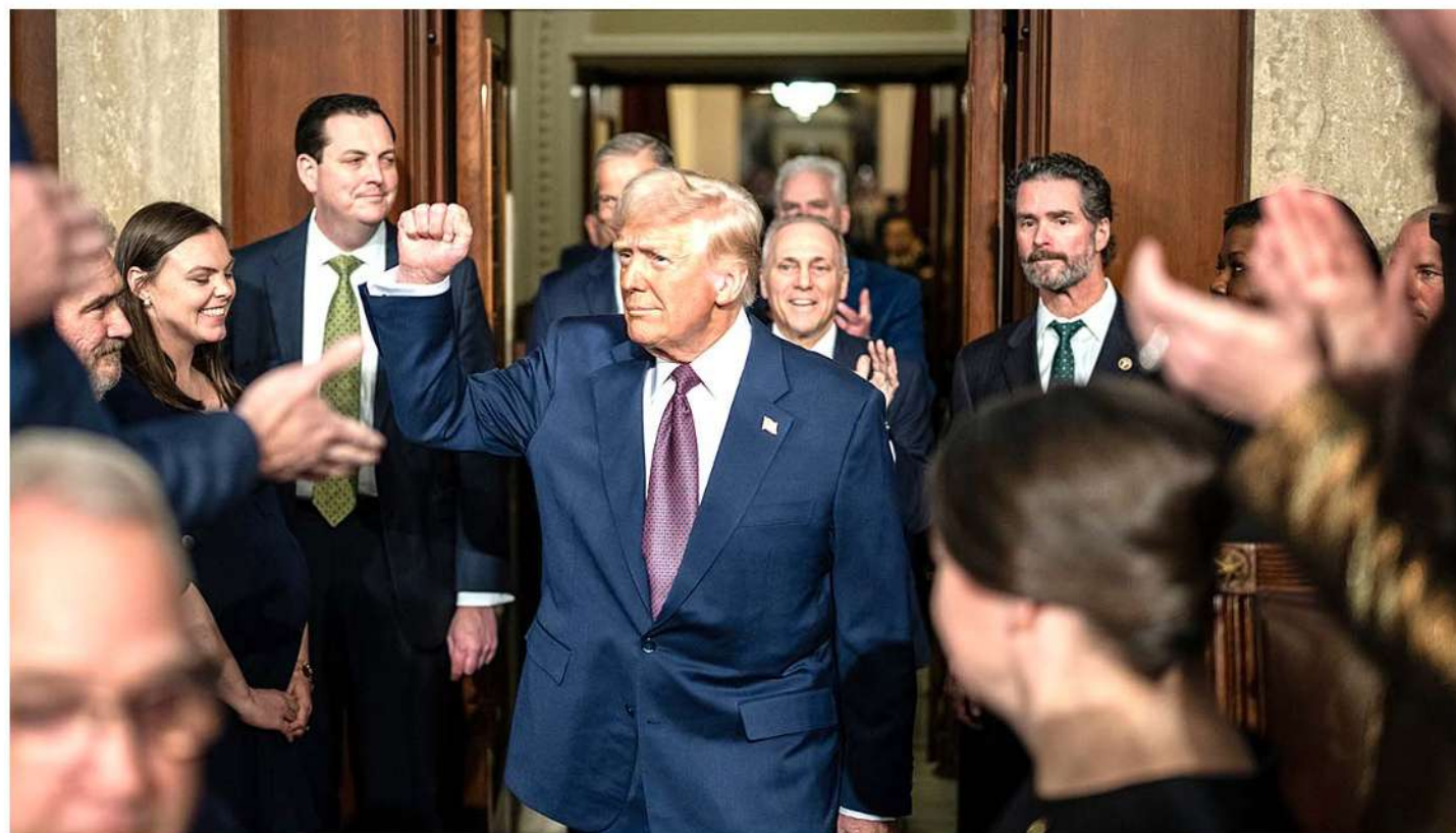
President Donald Trump arrives to address a joint session of Congress, at the U.S. Capitol in Washington.

While hitting out at the previous Democrat regime, he said, "We inherited from the last administration an economic catastrophe and an inflation nightmare. Their policies drove up energy prices and drove the necessities of life out of reach for millions of Americans...we suffered the worst