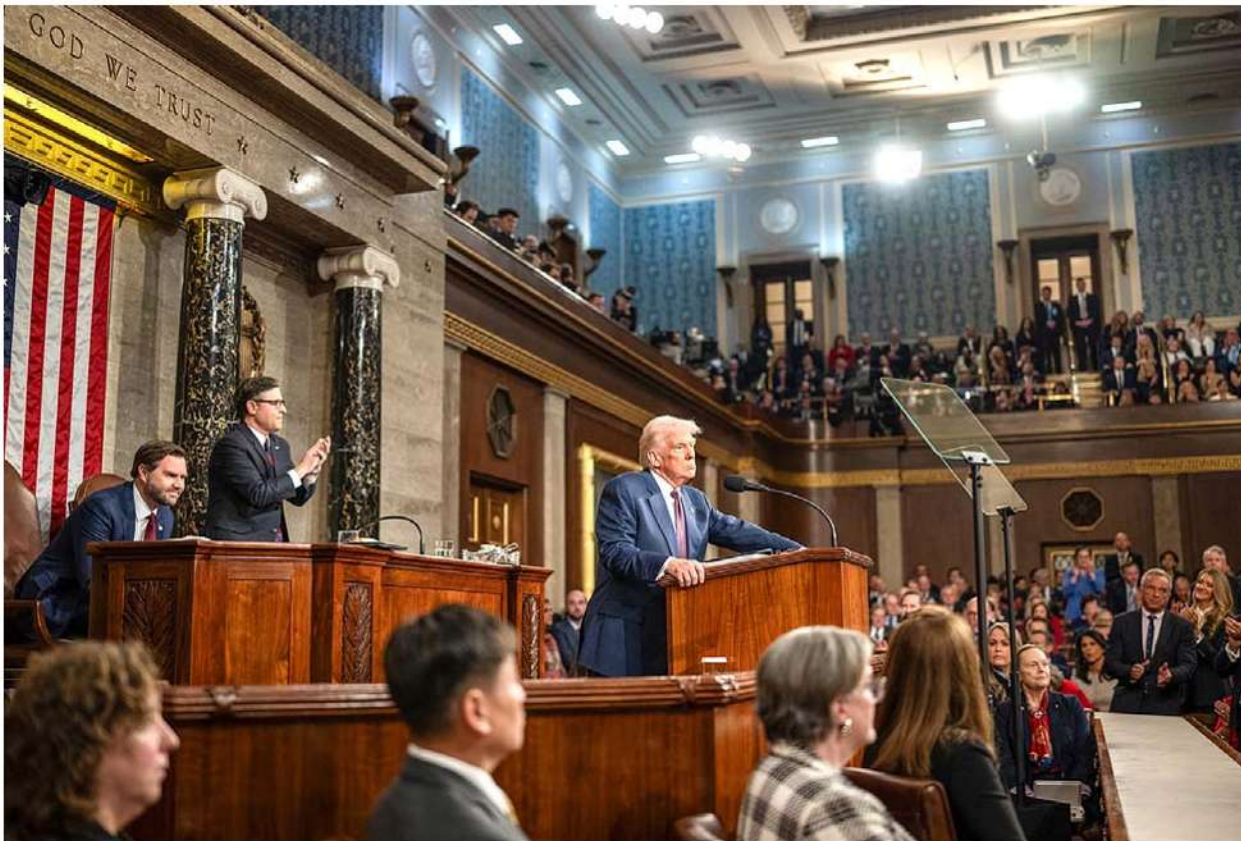
President Donald Trump addresses a joint session of Congress, at the U.S. Capitol in Washington.

Whatever they tax us, we tax them: Trump to India, EU, China