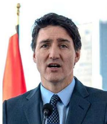
Justin Trudeau and Donald Trump

"Now, first of all, that's never going to happen," said the Canadian leader.